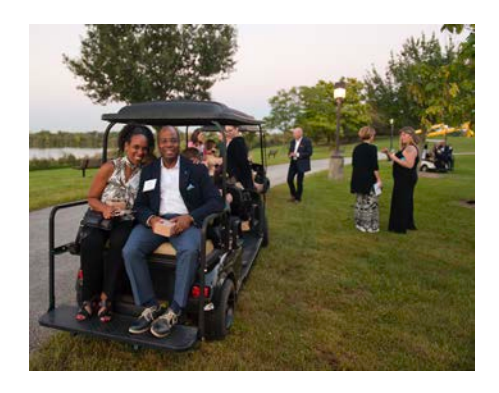
Continued and page 3

Sponsorship and ticket information: Sara Tweddle GSU Foundation stweddle@govst.edu or 708.235.7559