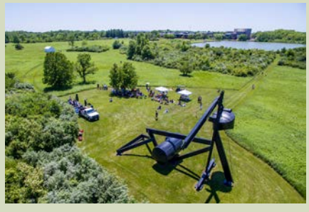
"Yes! For Lady Day" by Mark di Suvero welcomes guests and inspires the imagination, while the music plays.