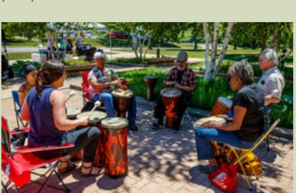
A community drum circle welcomed guests at registration and added energy to the start of the event.

The second annual Juneteenth Summer Solstice Celebration was wonderfully memorable for all who attended, starting with the perfect weather, fantastic music, delicious BBQ, and culminating with the joyful spirit shared between beautiful people – all in and around the monumental artwork of the Nate.